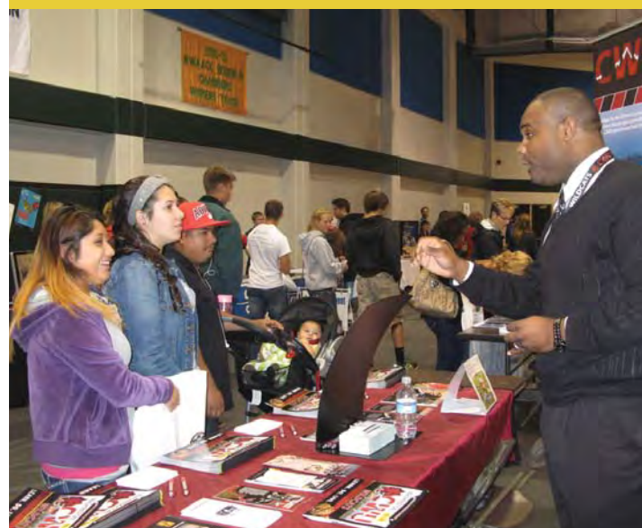
The Fall College and Career Fair is scheduled for November 3, from 6-8pm at Chemeketa Community College.