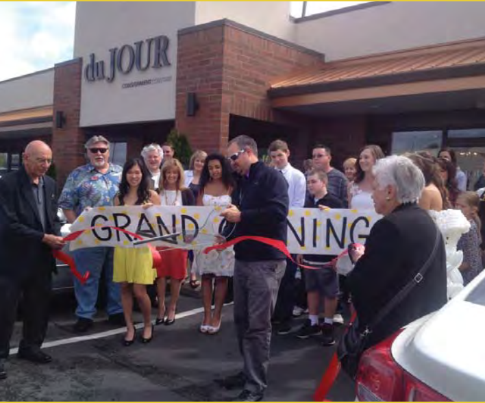
du JOUR Consignment Couture 990 Lancaster Dr NE, Salem 97301