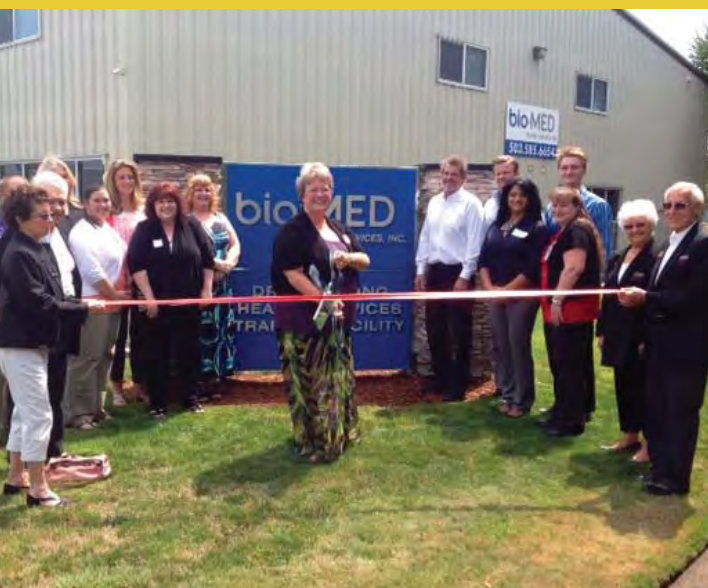
Bio-Med Testing Service, Inc. 3110 25th St SE, Salem 97302