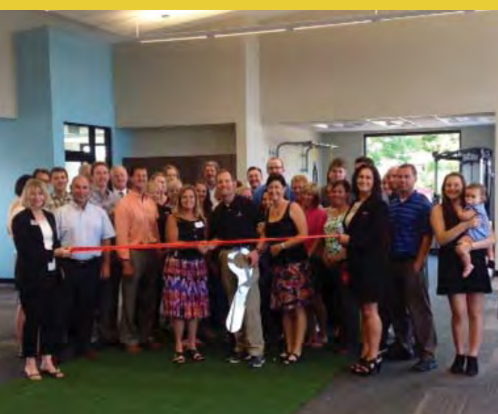
Northwest Rehabilitation Associates, Inc. 3270 Liberty Rd S, Salem 97302