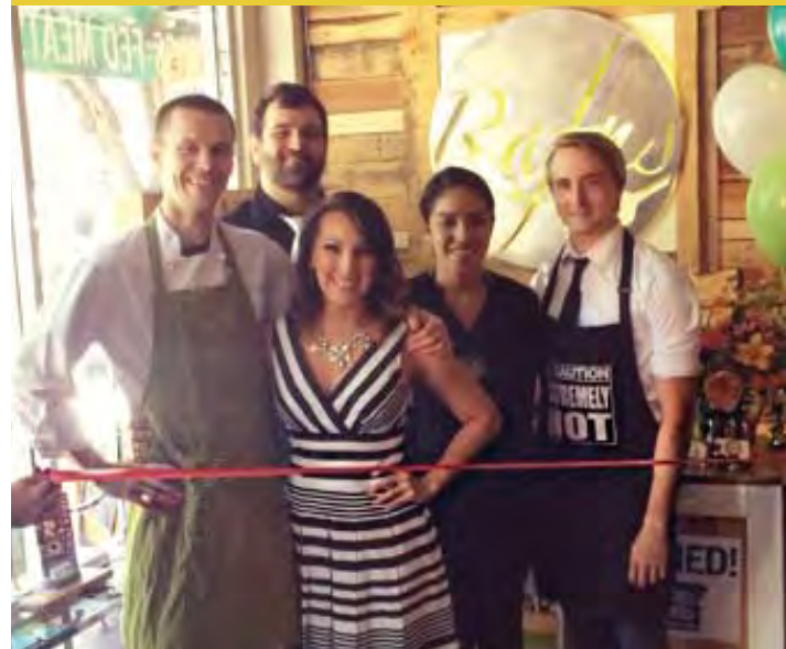
Living Culture Foods LLC DBA Rafns' 479 Court St NE, Salem 97301