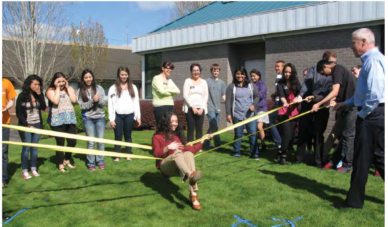
Leadership Youth closes out their first year with group activities focusing on team building and communications.

Financial support has strengthened the foundation. Between contributions and grants, the foundation received $18,000, including an $8,000 grant from U.S. Bank. These funds will go to supporting and expanding current programs.