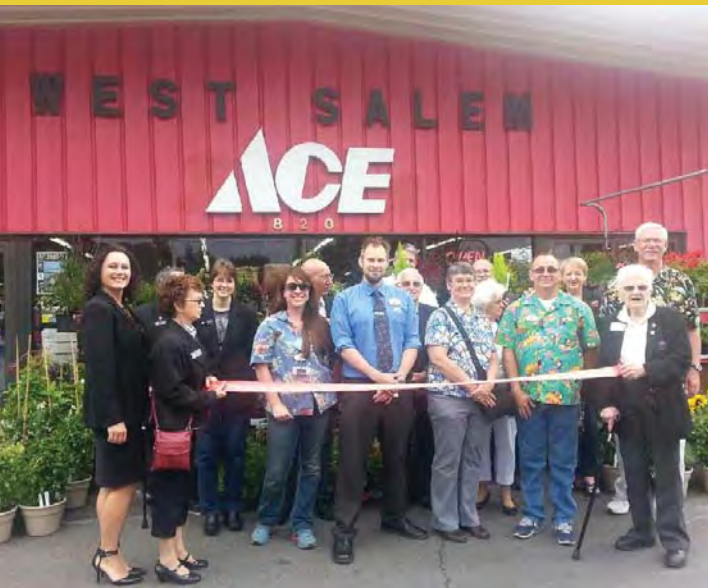
West Salem Ace Hardware 820 Wallace Rd NW, Salem 97304