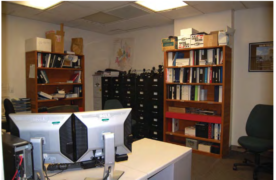
Close quarters: Twenty-five sergeants share this single office space in the current police department.

I think it’s very important that we, as leaders in this community, slow down a little, take a look at the big picture and determine really what exactly is best for this community.