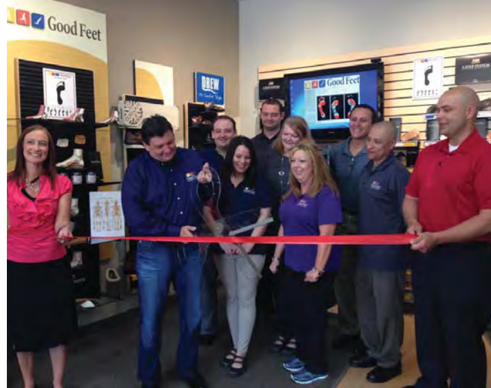
G.F. Oregon, Inc., dba Good Feet 737 Lancaster Dr NE, Salem 97301