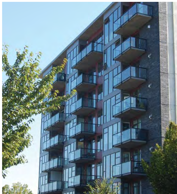
The Rivers Condominiums are now at 100 percent occupancy

It is clear that demand for downtown housing is reaching a tipping point and as a result, the Salem Area Chamber of Commerce has completed a comprehensive review of occupied and available living units to better understand possible implications for commerce in Salem’s core area.